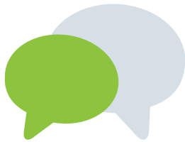
COMMUNICATION AND COLLABORATION